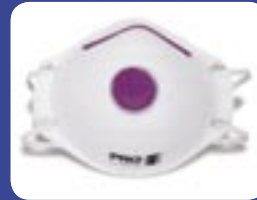
Respirator P1 with Valve PC315 Qty/box - 12 Qty/carton - 20 boxes