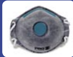
Respirator P2 with Valve and Active Carbon Filter PC531 Qty/box - 12 Qty/carton - 20 boxes