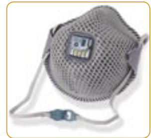
P2 Respirator with Valve and Active Carbon Filter PC823 Protects against nuisance-level organic vapours. Qty/box - 12 Qty/carton - 20 boxes