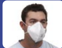
Respirator P1 Vertical Flat-Fold PC9111 Qty/box - 20 Qty/carton - 20 boxes