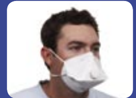
Respirator P2 with Exhalation Valve, Horizontal Flat-Fold PC2122 Qty/box - 12 Qty/carton - 20 boxes

ProMesh is part of the extensive range of high quality Personal Protective Equipment produced by ProChoice for Australian conditions.