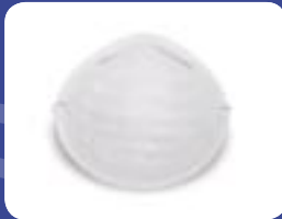
Non Toxic Dust Mask PC101 Qty/box - 50 Qty/carton - 20 boxes