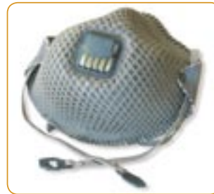
P2 Respirator + Valve PC822 For protection against mechanically and thermally generated fine dust, Fibres and Mists with valve include for extra air flow. Qty/box - 12 Qty/carton - 20 boxes