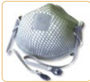
P2 Respirator PC821 For protection against mechanically and thermally generated fine dust, Fibres and Mists. Qty/box - 12 Qty/carton - 20 boxes