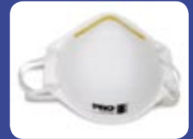
Respirator P2 PC305 Qty/box - 20 Qty/carton - 20 boxes