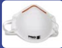
Respirator P1 PC301 Qty/box - 20 Qty/carton - 20 boxes