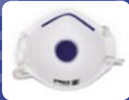
Respirator P1 with Valve PC321 Qty/box - 12 Qty/carton - 20 boxes